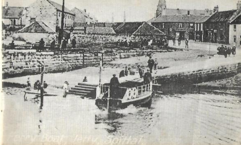
Border Chief Spittal

Before the establishment of the modern omnibus service, the ferry provided the easiest means of travelling to Berwick. Ferry men would row passengers across, while the most famous of the larger ferry boats was the paddle steamer "Susan," often seen in photographs taken before 1908. Her successors, notably the "Border Chief," seen here at Spittal landing, continued until the mid 1950s.